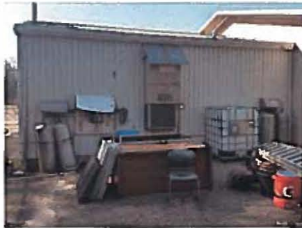
Exterior at Restrooms