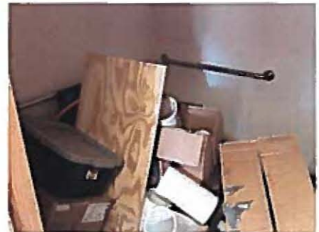
Existing Non-Functional Restroom requiring domestic water and waste connections