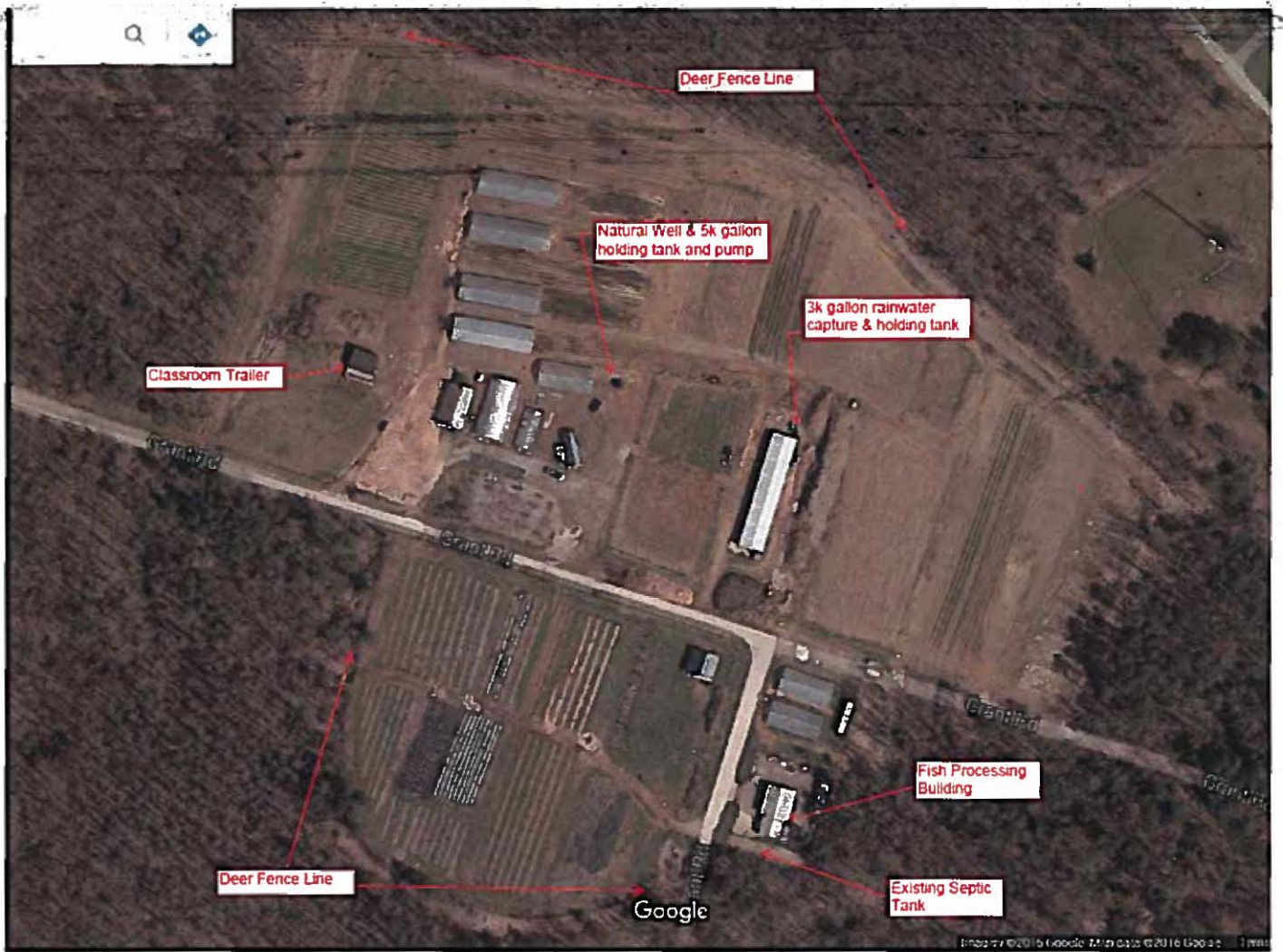
Firebird Farm Site Aerial view