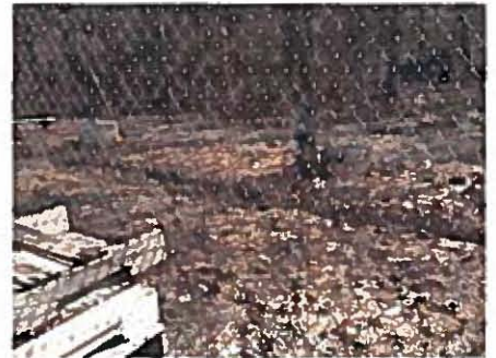
Existing Septic Area