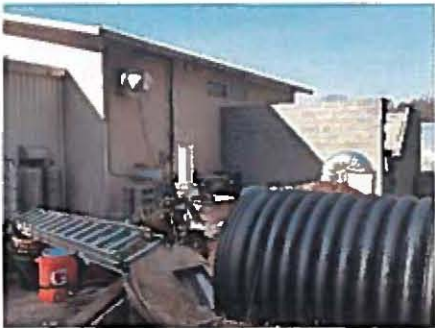
Exterior of Processing Building