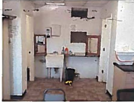
Deep Sink Janitorial between